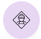
Health & Safety