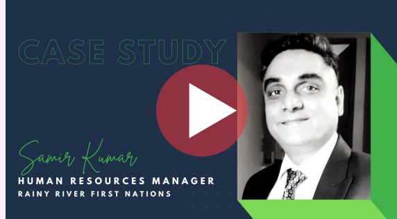
Rainy River First Nations Public Administration