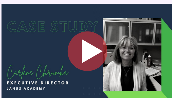
Janus Academy Education