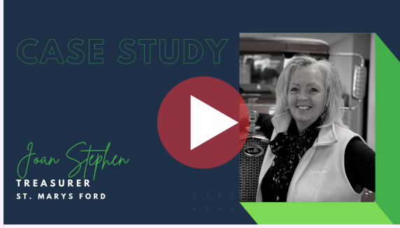
St Marys Ford Manufacturing