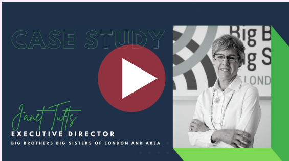
Big Brothers Big Sisters of London and Area Nonprofit